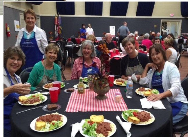
At the end of the evening we still had a smile on our faces. Everyone agreed it was a job well done