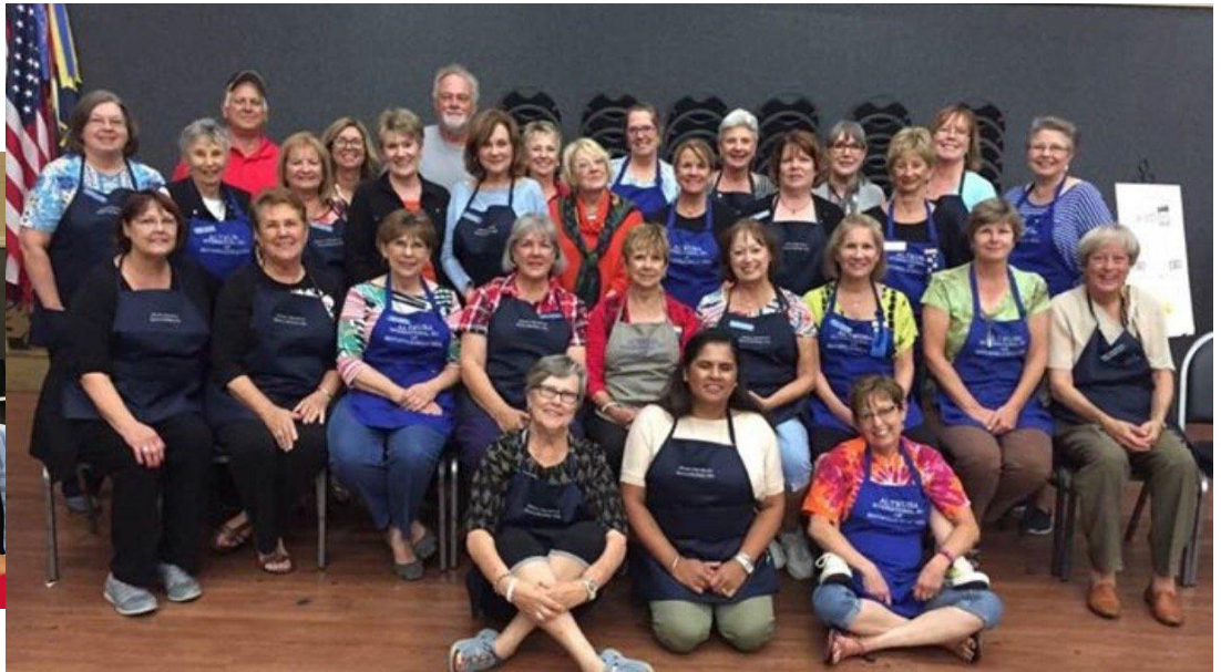
The 2016 Spaghetti Dinner Crew!