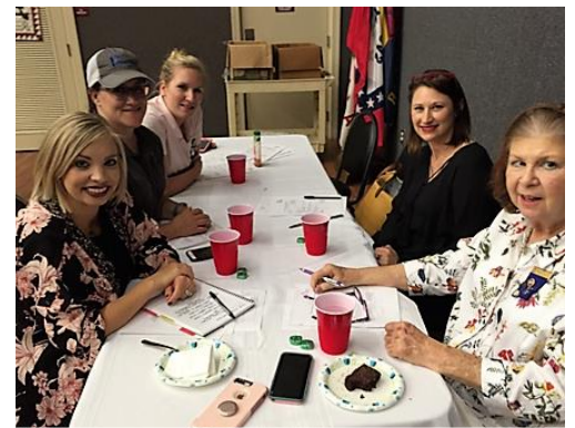
Washington County once again supported our efforts by holding their directors meeting at our Spaghetti Dinner.