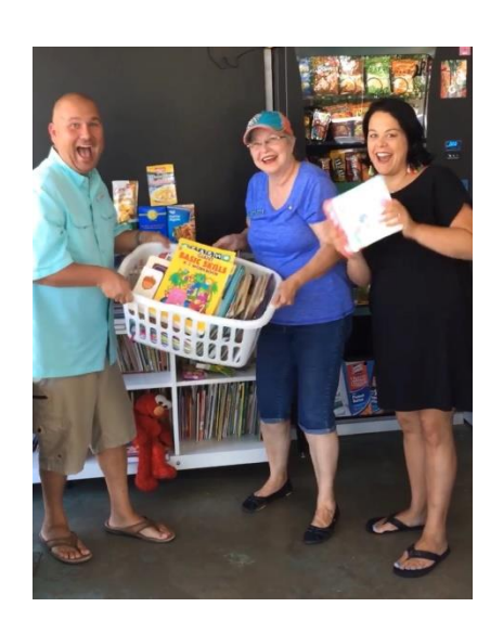
On May 21 <sup>st</sup> . They restocked the book shelf for another learning night at the Sugar Creek Laundry. We partner this project with the University of Arkansas Early Childhood Literacy program.