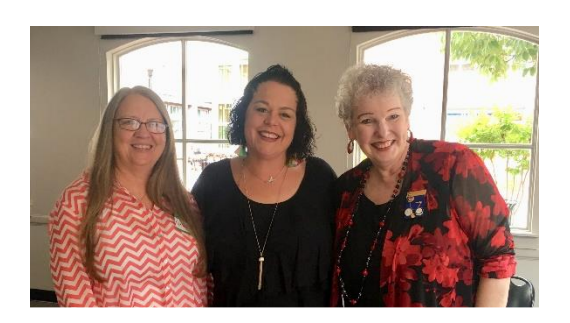
Our friends from Altrusa Of Fayettville made the journey to help us celebrate.