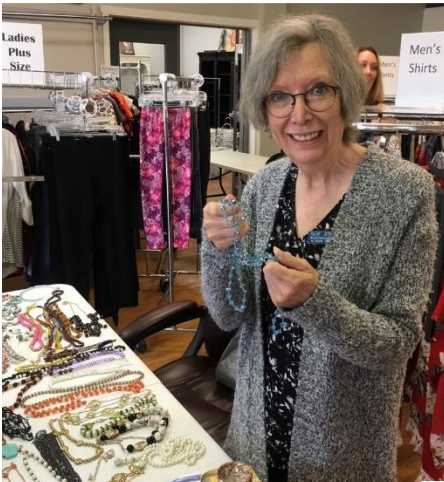
Our meeting on Sept. 6 took place at the Deb Project from 9 a.m. to noon. Club members moved dishes, sorted shoes, separated and arranged jewelry, and much much more.