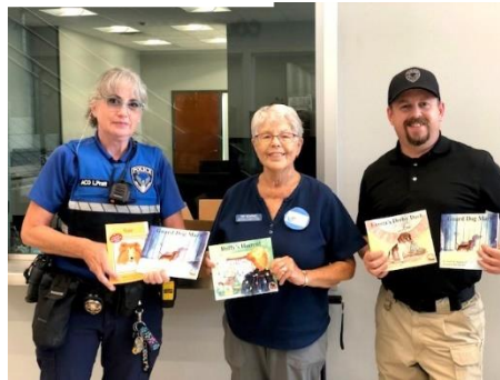
The Police department