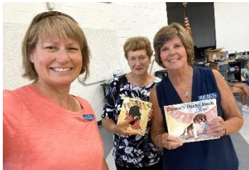
Free meals for kids