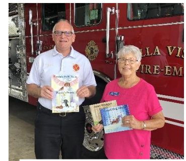
The Fire department