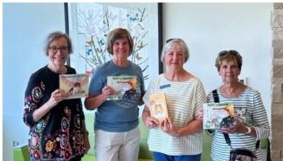
Arkansas Children's Hospital in Springdale