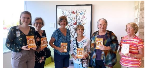
Arkansas Children's Hospital Northwest