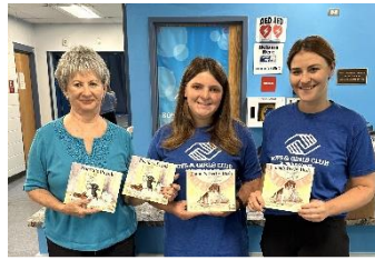
The Bella Vista Boys and Girls